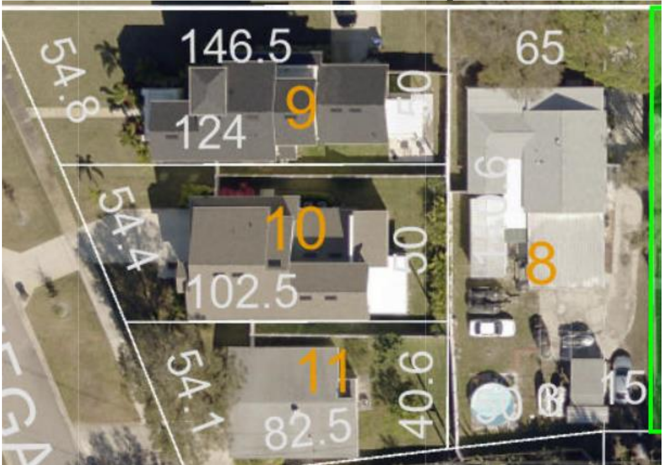
Two monsters next to normal JT home.