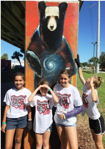
Playing with Bear