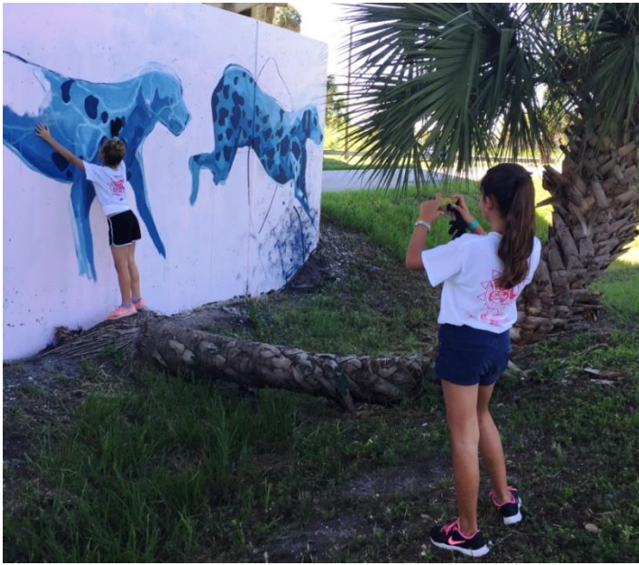
Petting the Dog