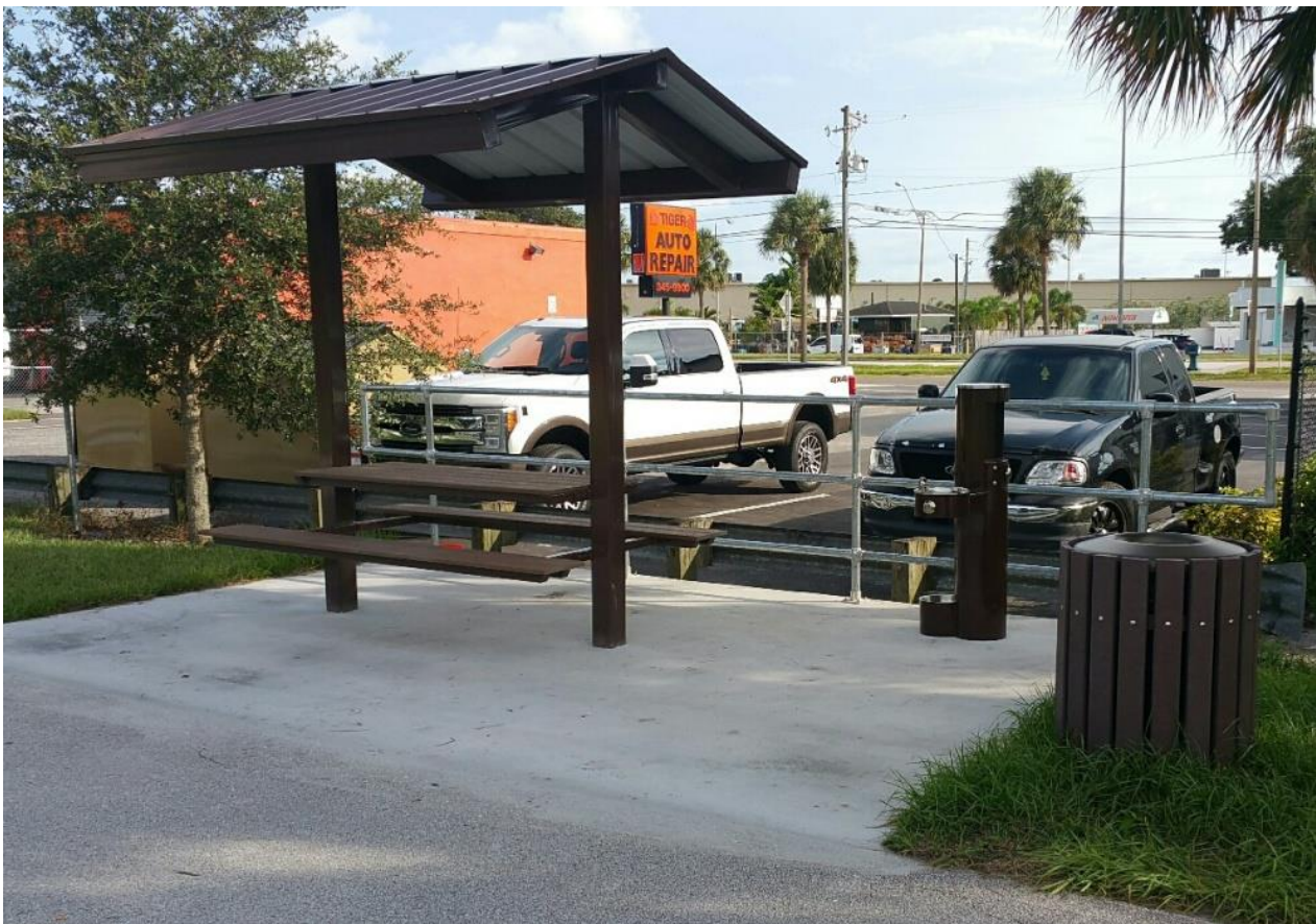
NEW Shelter on Pinellas Trail + Trash can. Donated by Greg Descent, Northwest Collision.