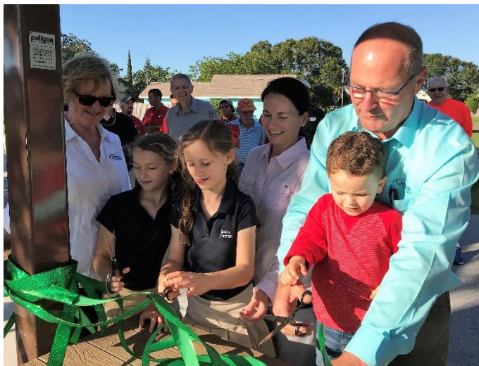
Descent Family cuts ribbons.