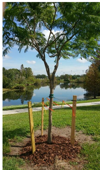
GIFT Tree: Uprighted, 2 Bags Top Soil, 2 Bags of Pine Bark Mulch.