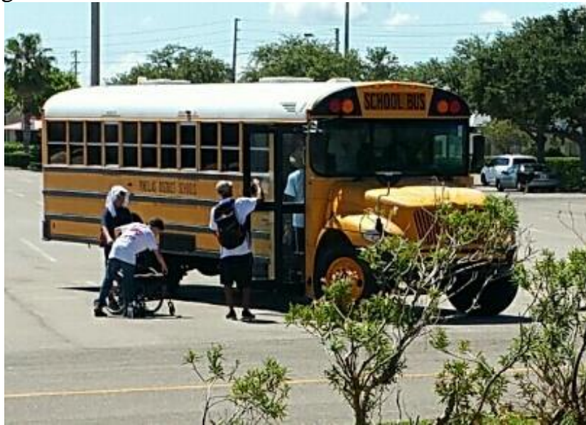
Ahhh! Return to Air Conditioned Bus!