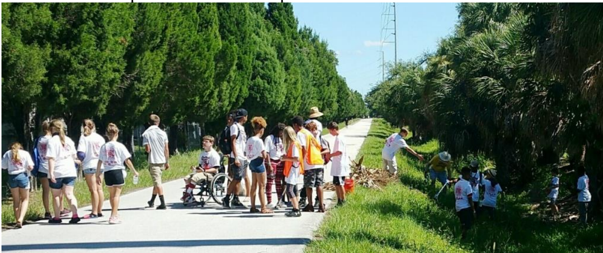
“In the Ditch Crew” wraps up.