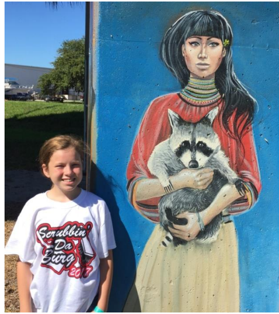
New Friends: Raccoon and Maiden