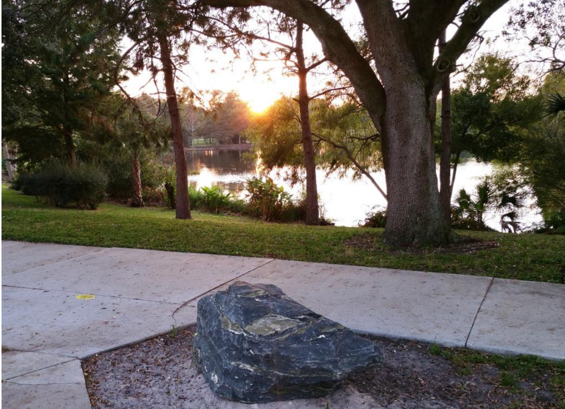
Sunset in Walter Fuller Park