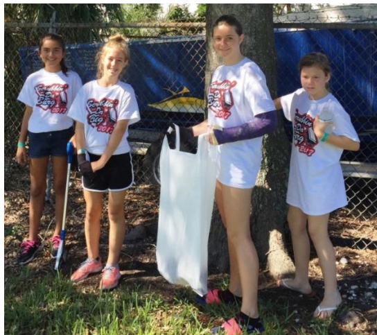
“Litter Crew” at Tyrone Overpass field.