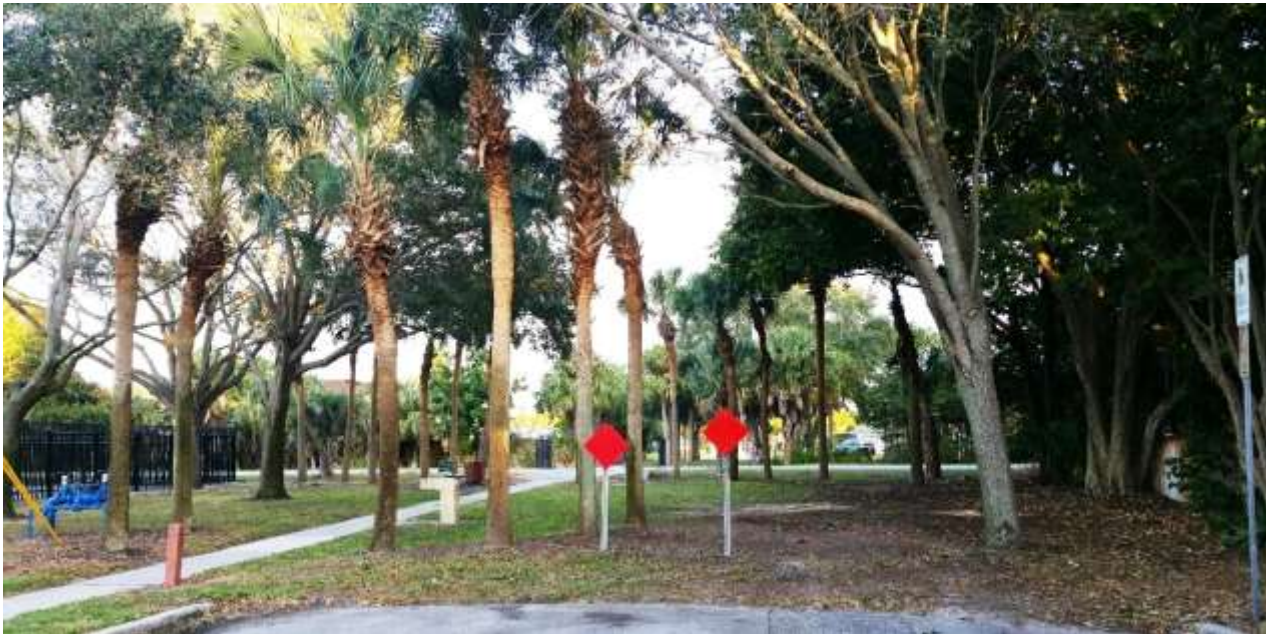
View from 71 st Street N.

And -- we painted the brown splotchy graffiti bench beautiful green. This caps off the Beauty of this great mini-park.