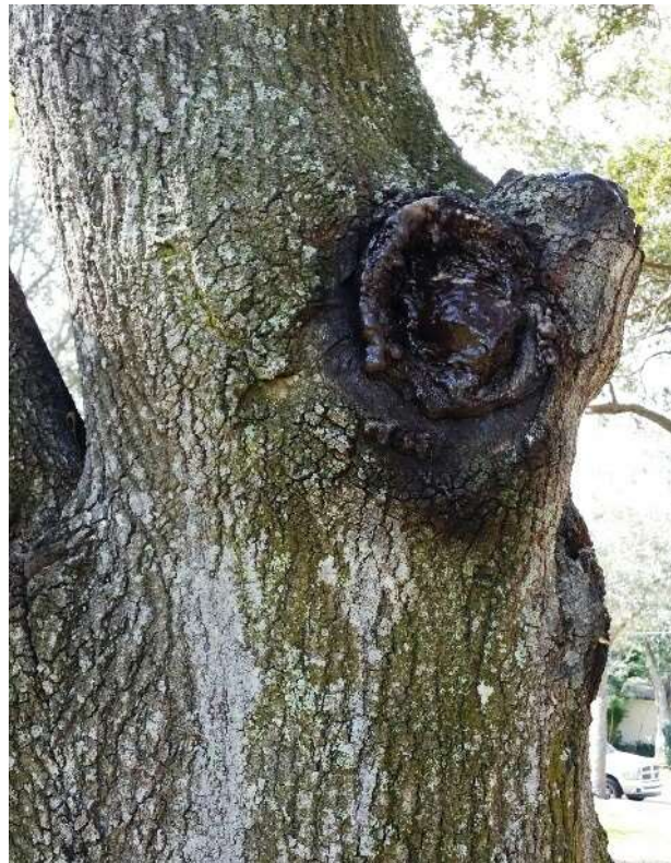
After filled for health of tree.