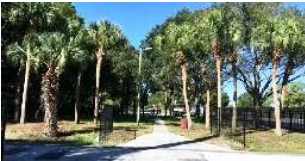
View from Pinellas Trail. Note NEW black fences.