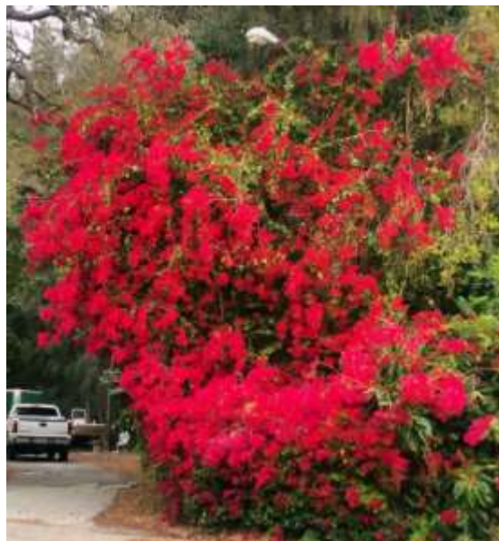
Bougainvillea in Full Bloom

Another enhancement to the program includes an increase to the on-street parking duration from 2-3 hours to a 6-hour max for an additional charge. This enhancement is due to the many requests by citizens and customers who want to enjoy the downtown amenities for an extended period of time and still be able to utilize on-street parking spaces.