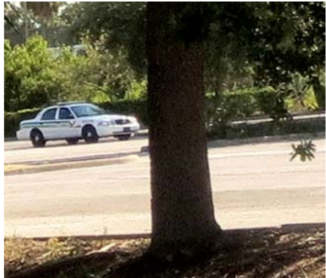
Invisible Police Parking