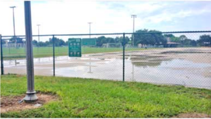
Flooding Standing Water in Soccer Center Parking Lot