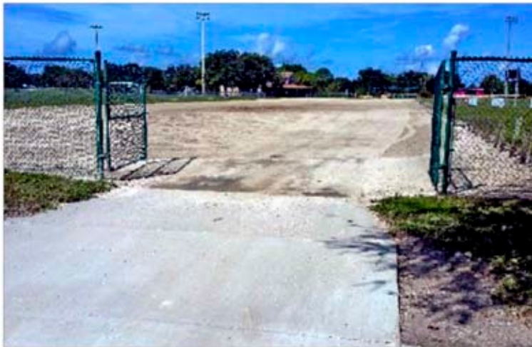
Graded New Surfacing Material + New Concrete Driveways for Soccer Center Parking Lot.