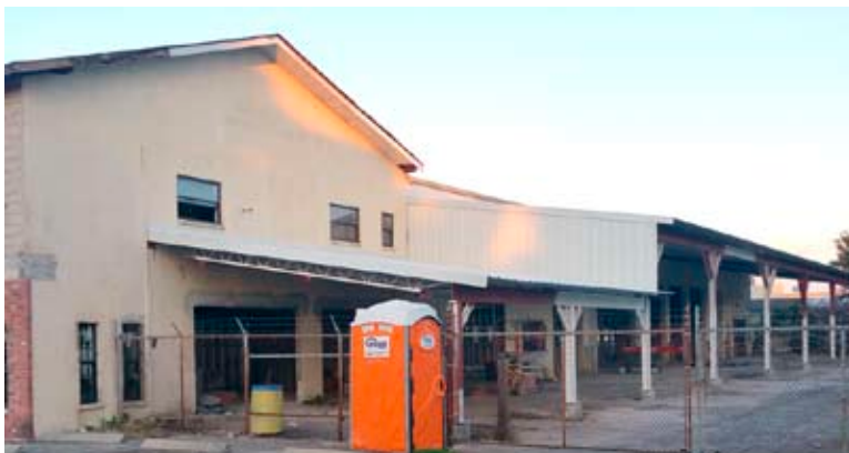
New NWCC back