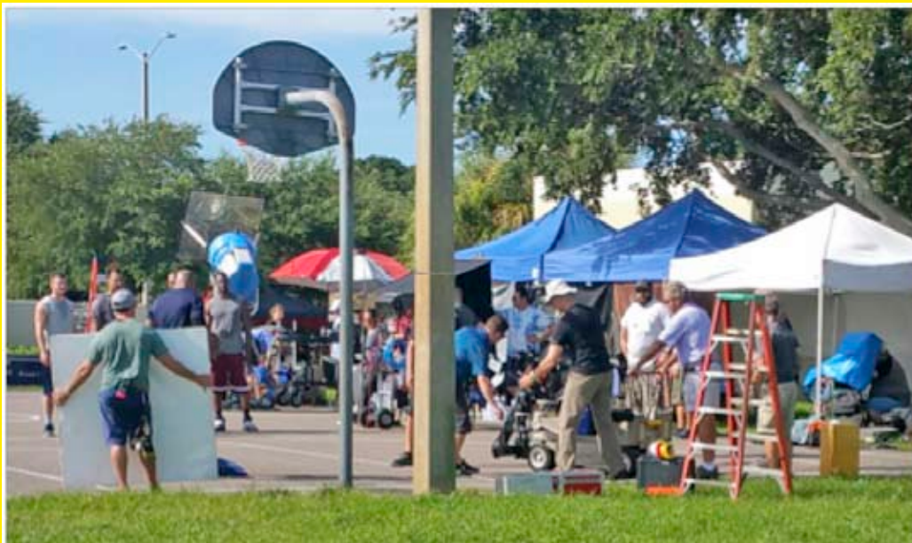
Brighthouse TV Commercial filming at Walter Fuller Rec Center.