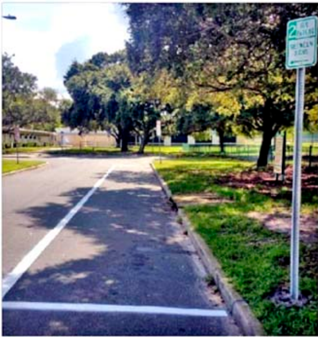
Designated, Painted, Signed parking for Dog Park