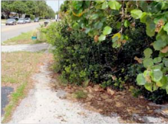
CODES Clean UP