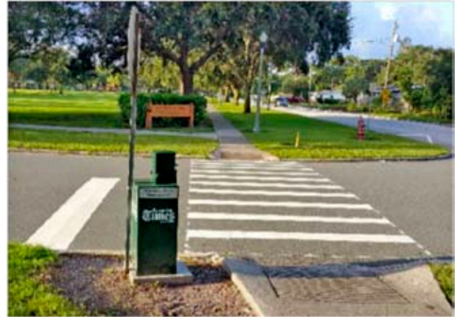
30th Ave N in Walter Fuller Park