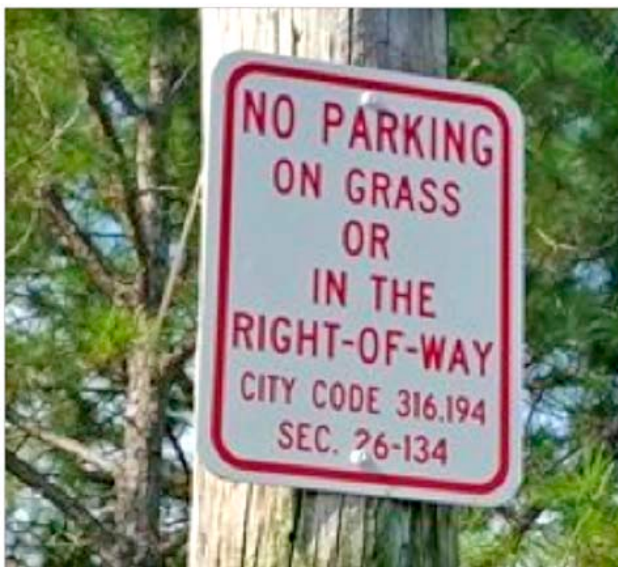
78th St. along Park prevents parking on grass. Appreciate use of existing pole for sign