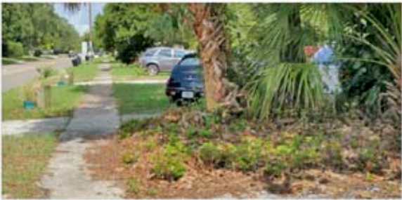
Removed by Community Services after 3 months