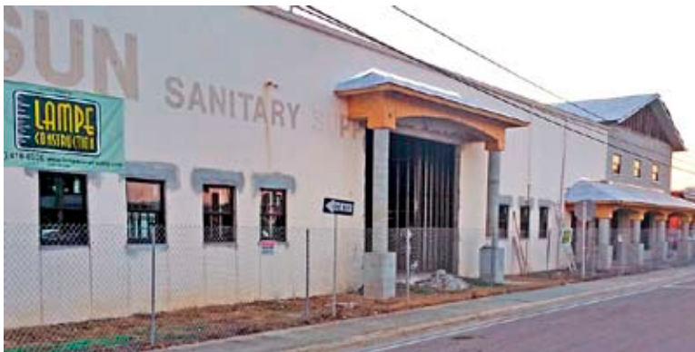
New NWCC front