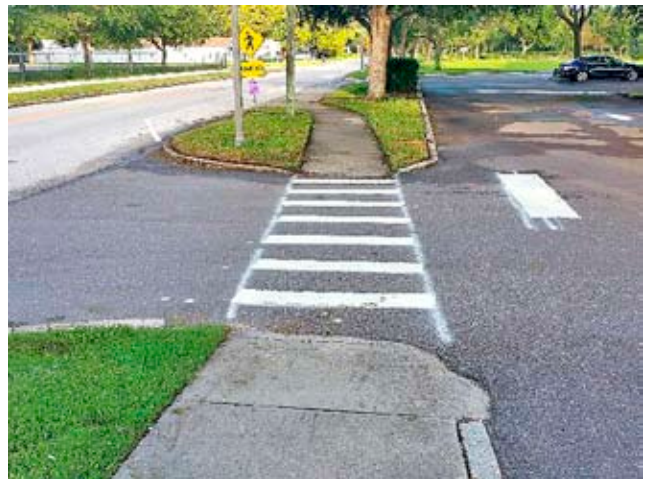
Swim Pool Parking Lot Walter Fuller Park