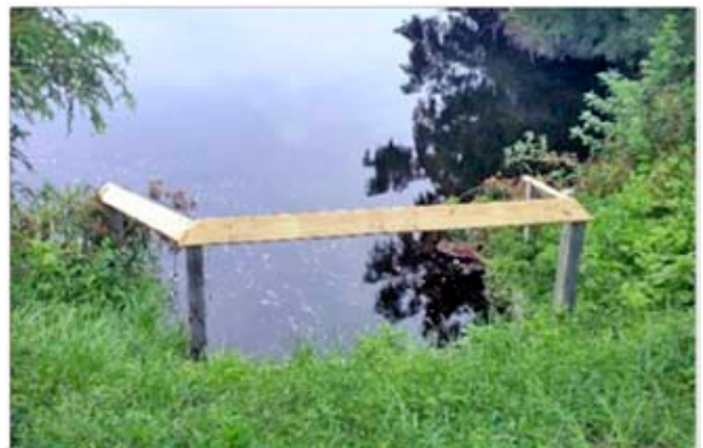
New Railing around inflow culvert.