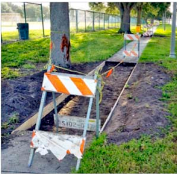
8 Sections of Sidewalk REPLACED.