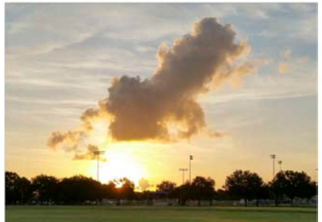
Sunrise while tending Volunteers Garden.