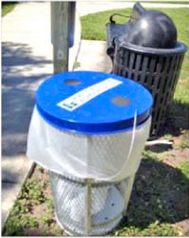
ReCycle container in WF