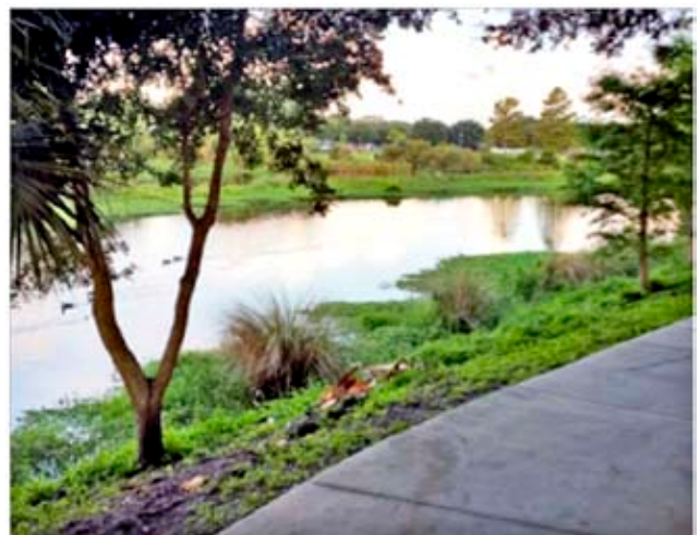
Large dead Palm removed, better views.