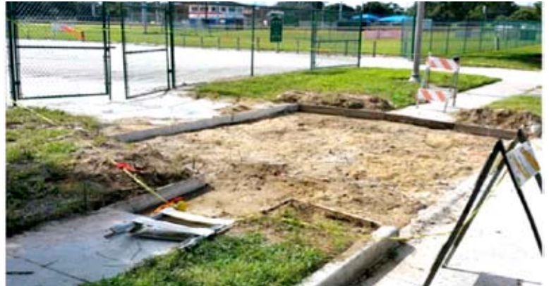
3 Driveways REPLACED