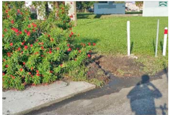
City created drainage “ditch” to solve flood problem at Trail Entrance 30th Ave/71st St N.

TIP ~ Sept. 26, CareFest project, 8 JT Volunteers joined by 10 Volunteers from “City on a Hill Church.” 2 trucks+ day laborer, trimming palm trees + +.