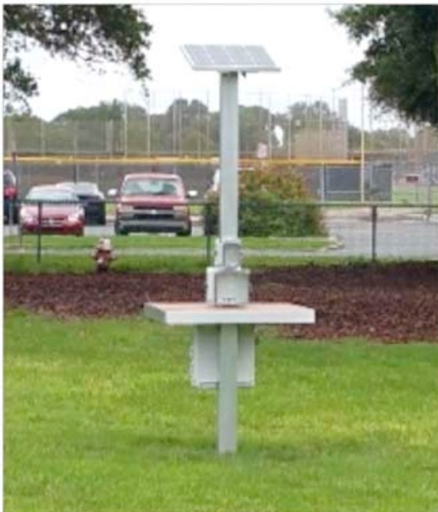
“Charging Station” for cell phones and electronic devices.