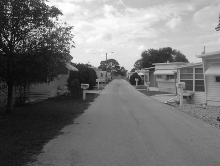
Eagles Nest today