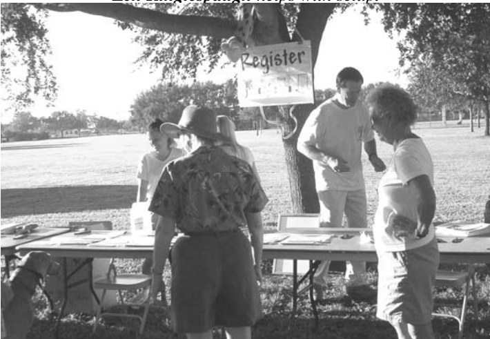
Preparing the Registration table.