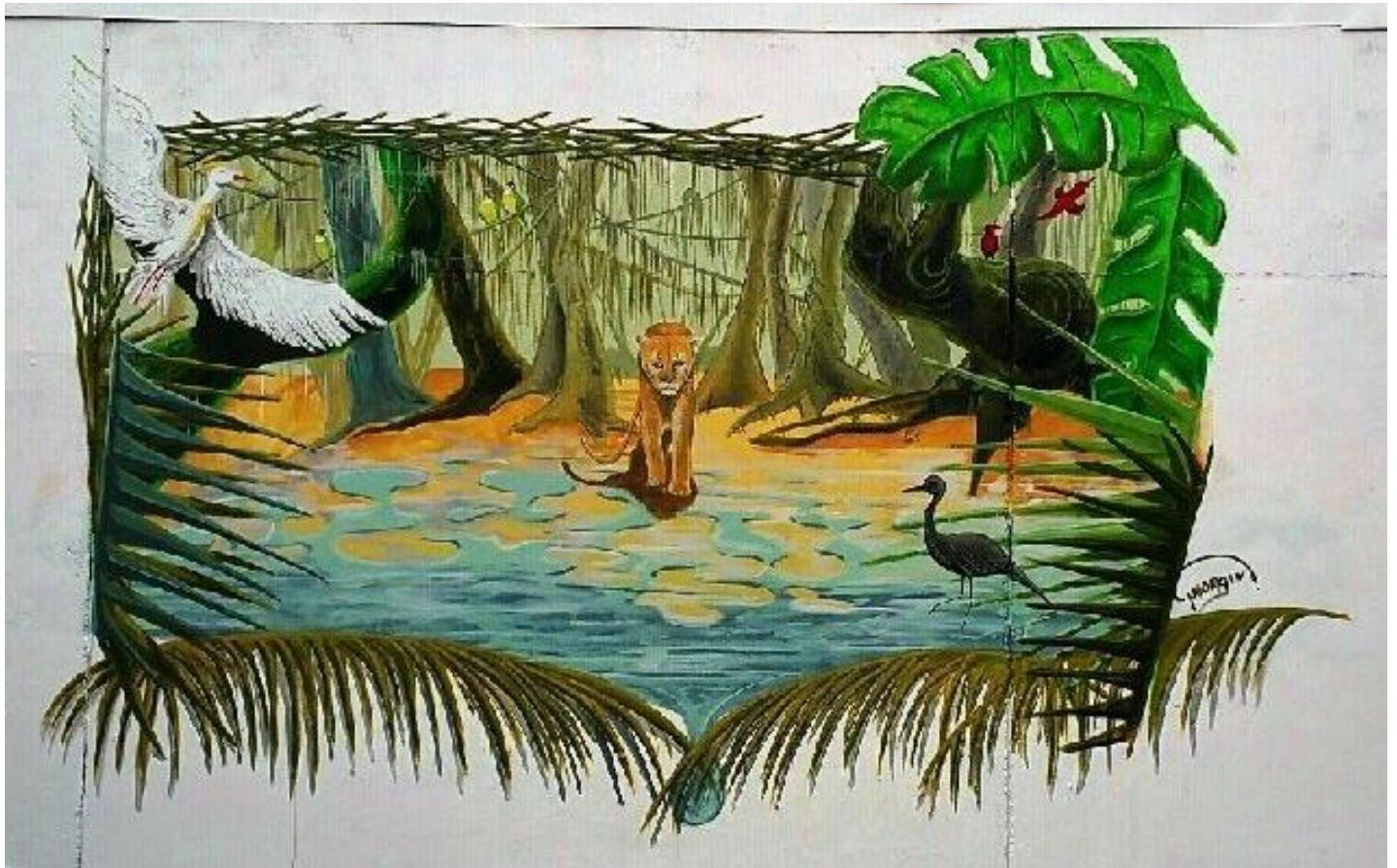
Panther is looking at YOU wherever you stand!