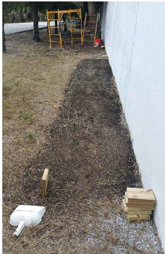
Leveling the Ground next to building.