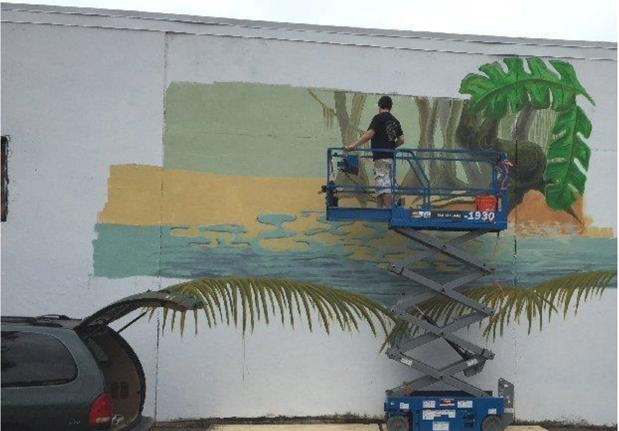
Sunday Afternoon 1pm