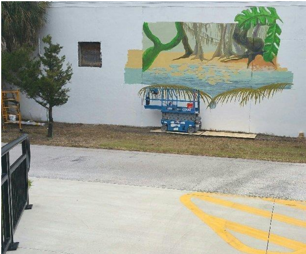
Sunday Evening 5pm