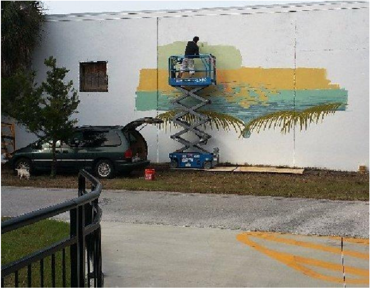
Sunday Morning 10am