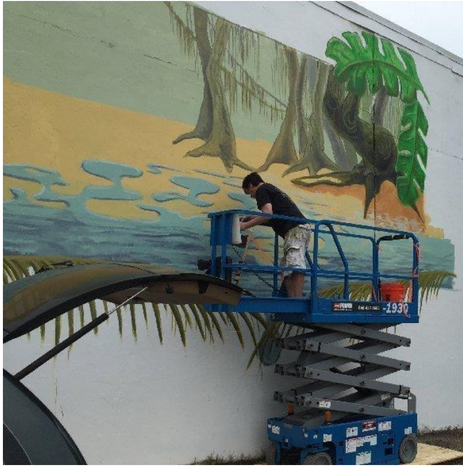
Sunday Afternoon 2 pm