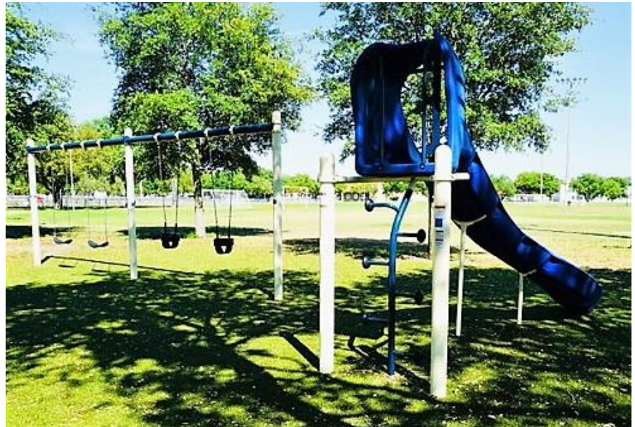
NSSP at Grand Opening