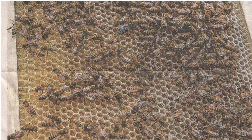
Honeybees play an essential part in about one-third of the fruit and produce Americans eat.