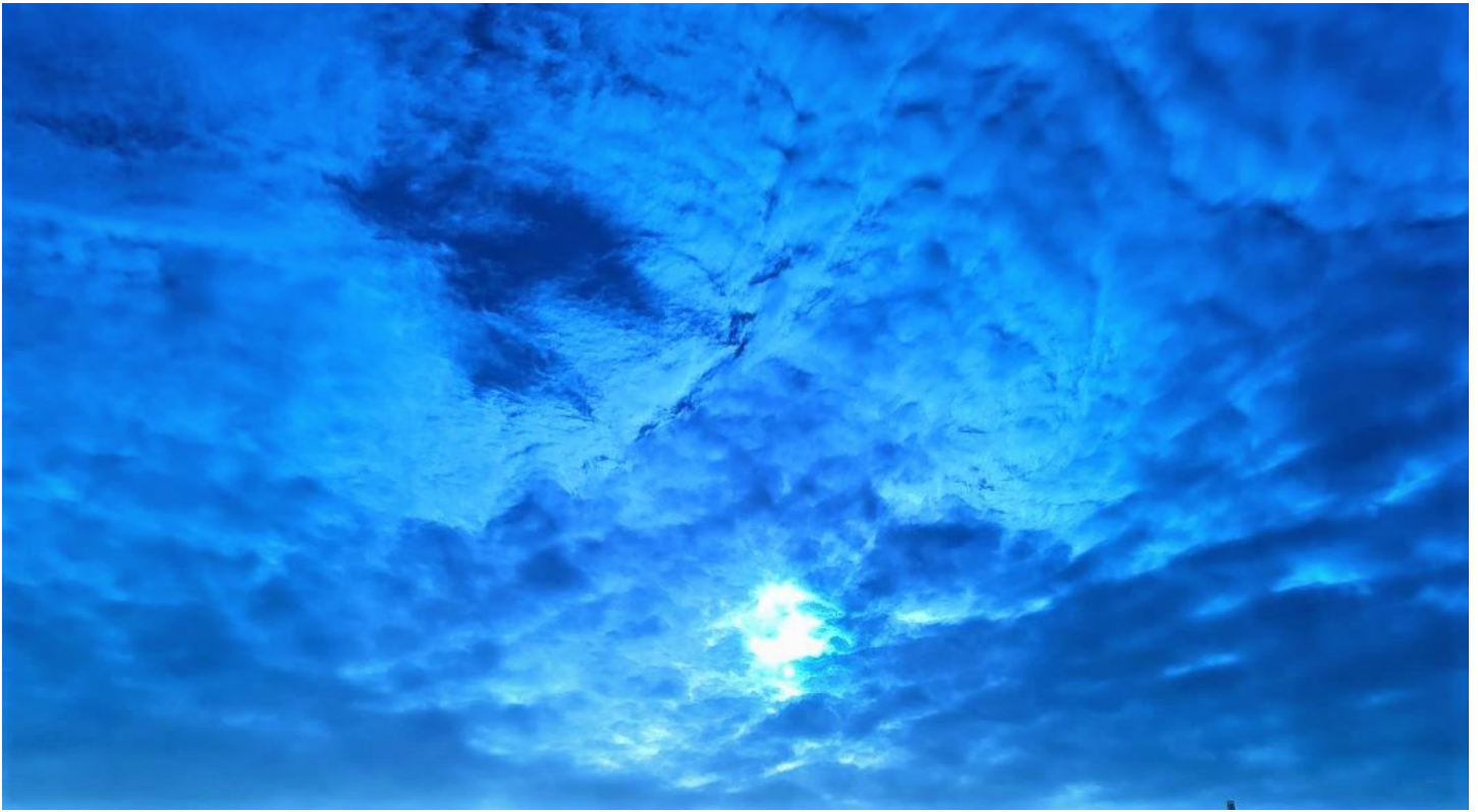
Tyrone Stoplight... Sun through top of windshield tinting . . . Perfect Moment. Reminds me of Van Gogh.