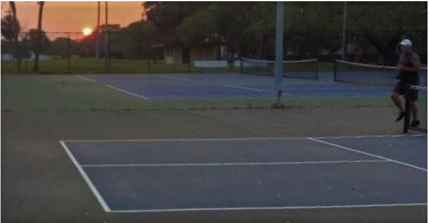
Pickleball SUNRISE at Walter Fuller!