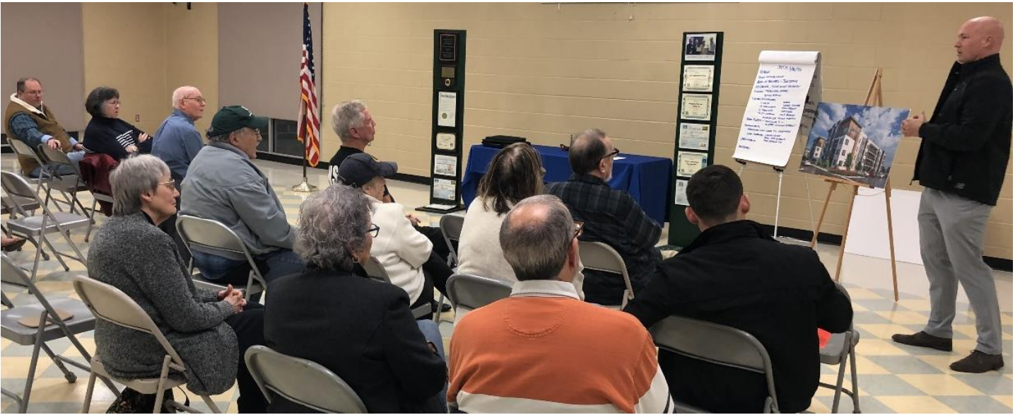
Rapt attention from the audience.