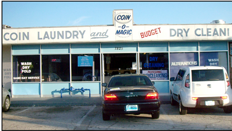
Coin O Magic Laundry, Dry Cleaners, and Alterations.