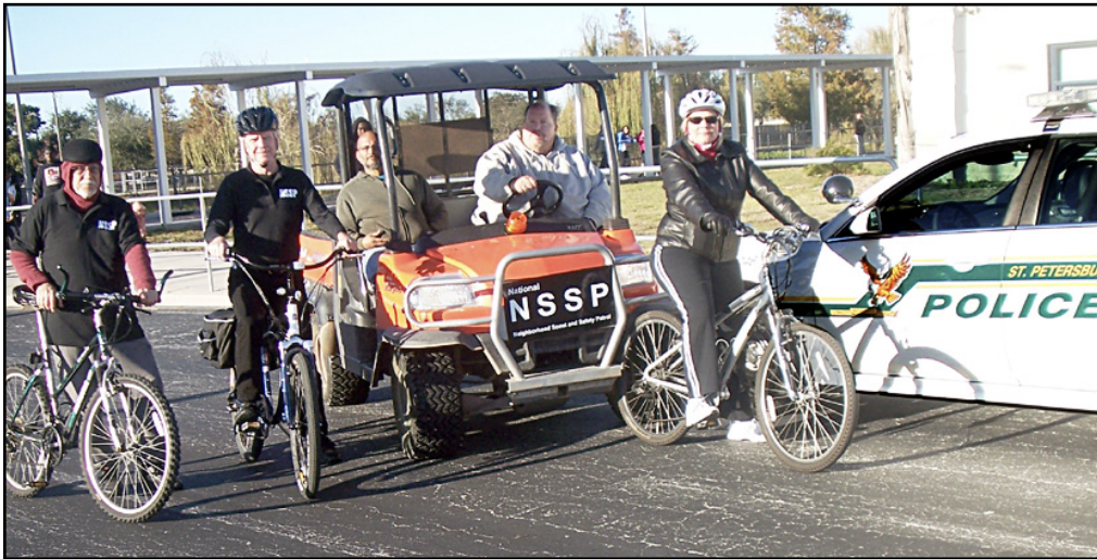
NSSP at Azalea Middle School

Multiple people have remarked on "seeing people with NSSP shirts on!"