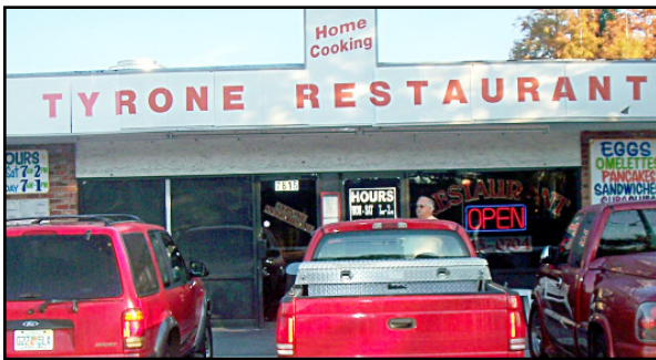
Tyrone Family Restaurant