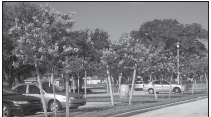
New flowering trees (12) landscaping at Walter Fuller Pool.