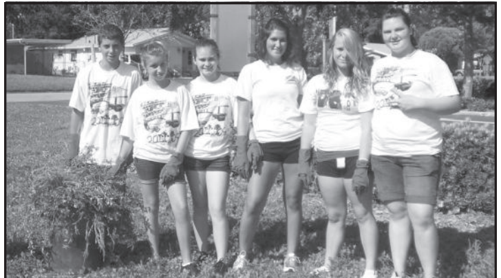
Teen Council at Walter Fuller Center weeding the newly landscaped areas!