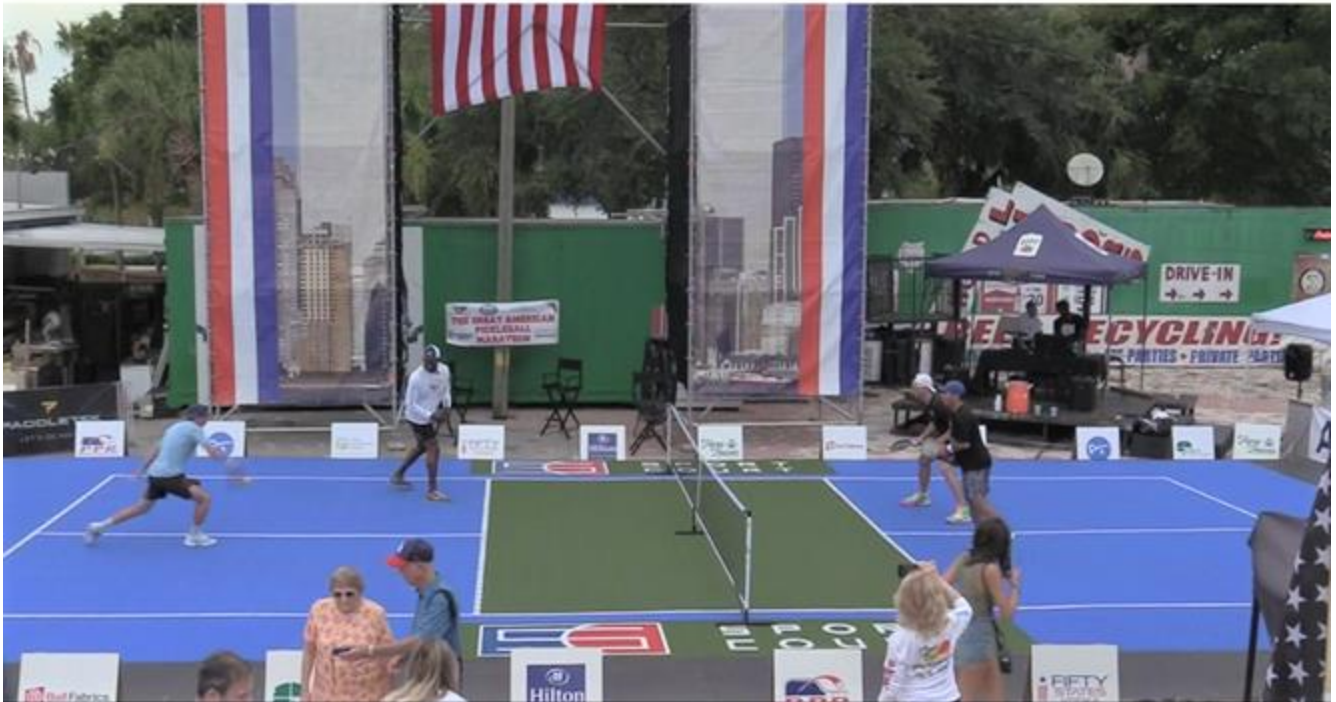
Kyle Yates #1 in U.S. Pickleball, blue shirt, left, with NFL players.