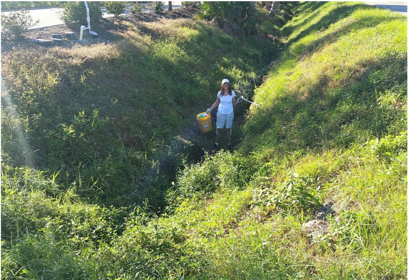
DEEP in the DITCH!