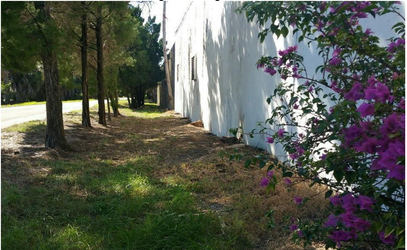
Cleaned up from 8 palms removed