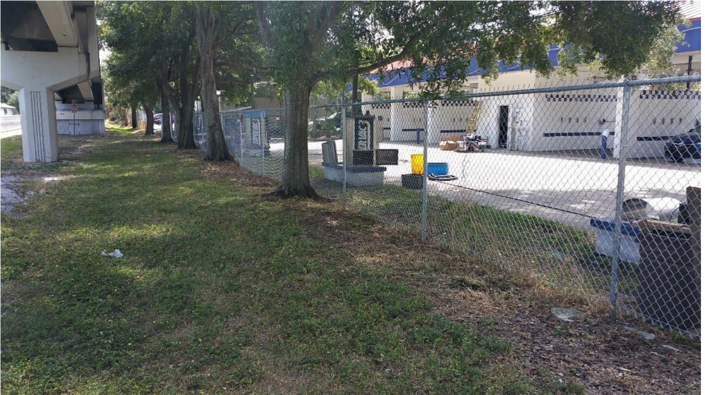
38 th Av N behind Texaco and Car Wash