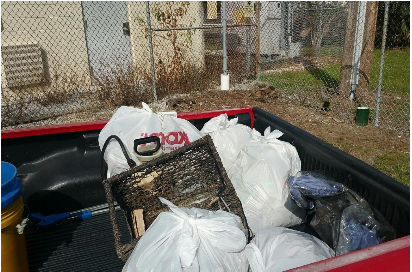
7 Bags of Trash + Crate