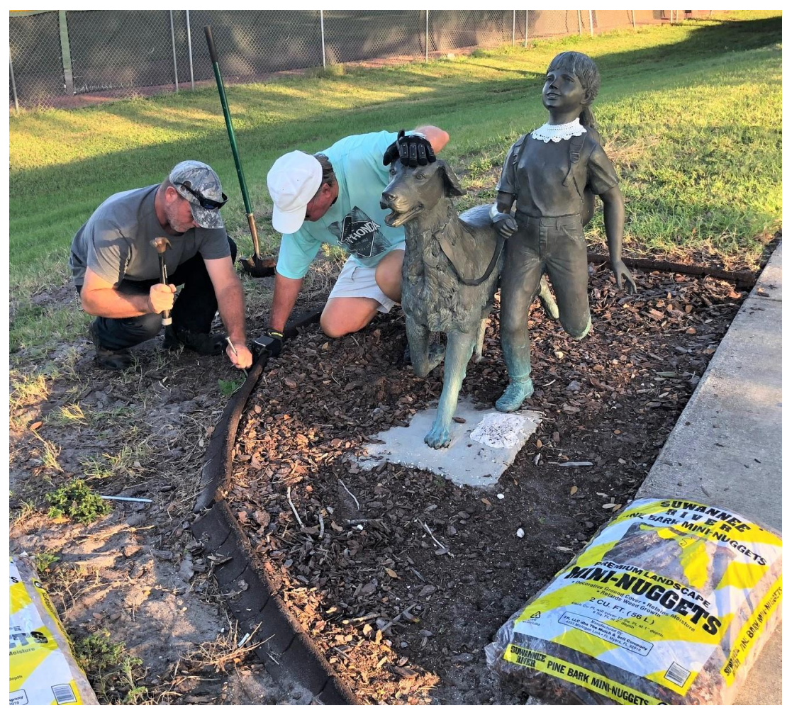
Securing the border around Girl Walking Dog Statue.