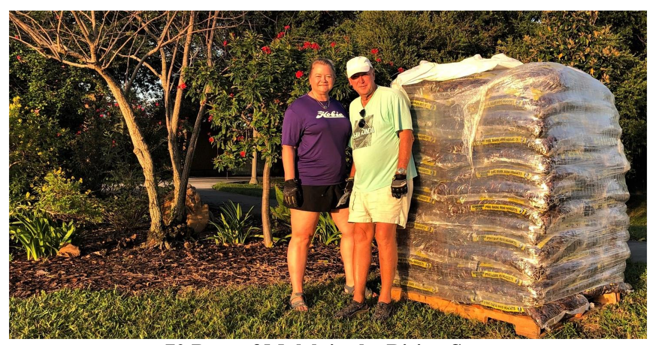
70 Bags of Mulch in the Rising Sun.