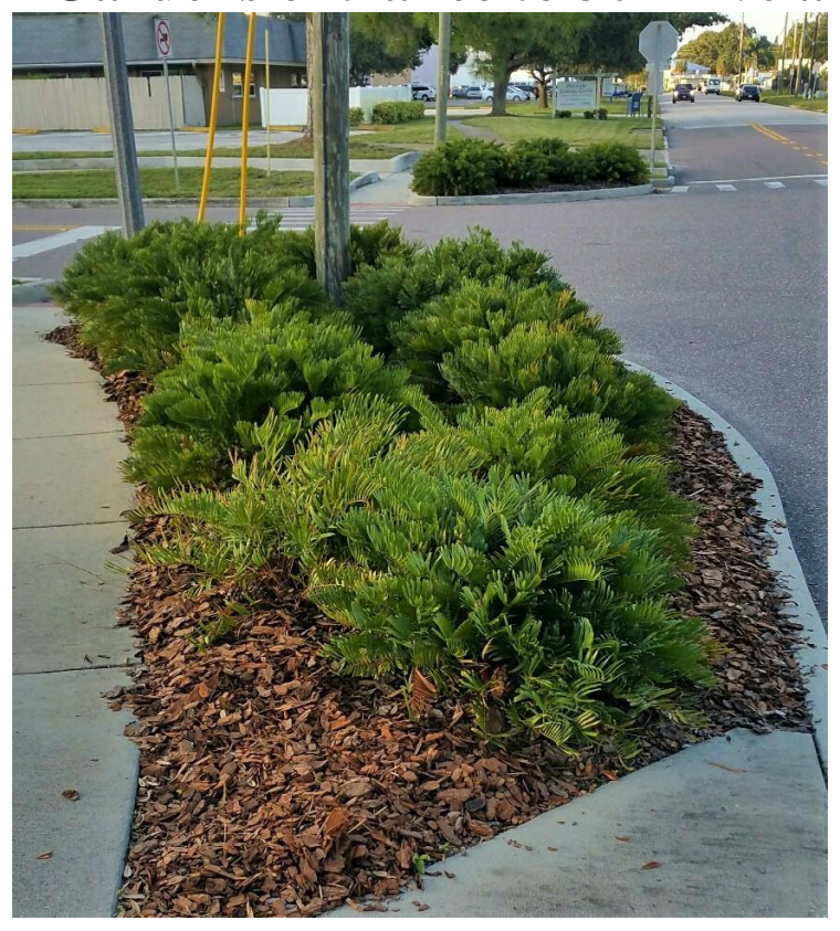
Stonehenge Park beneath Tyrone Overpass