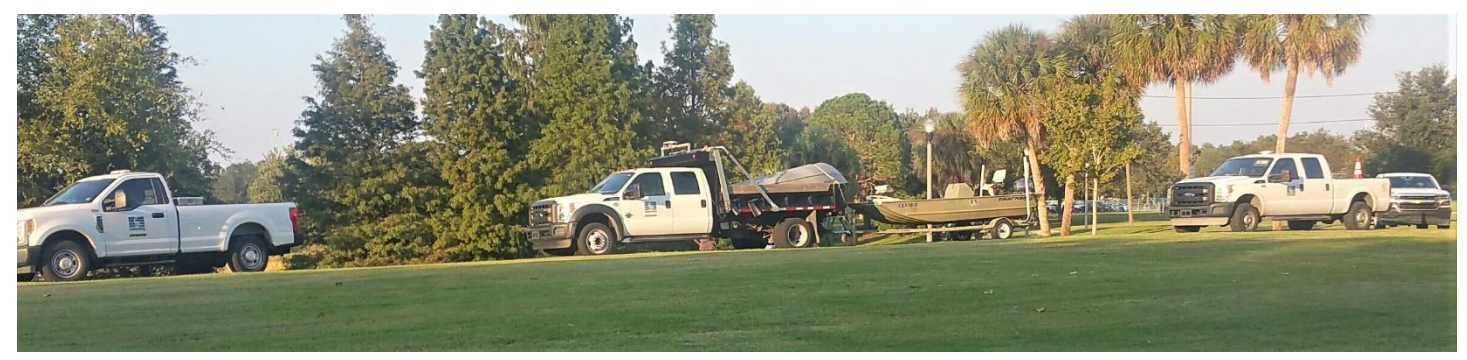
10 Trucks were on site, removing fish, put in 2 pumps + aerator.