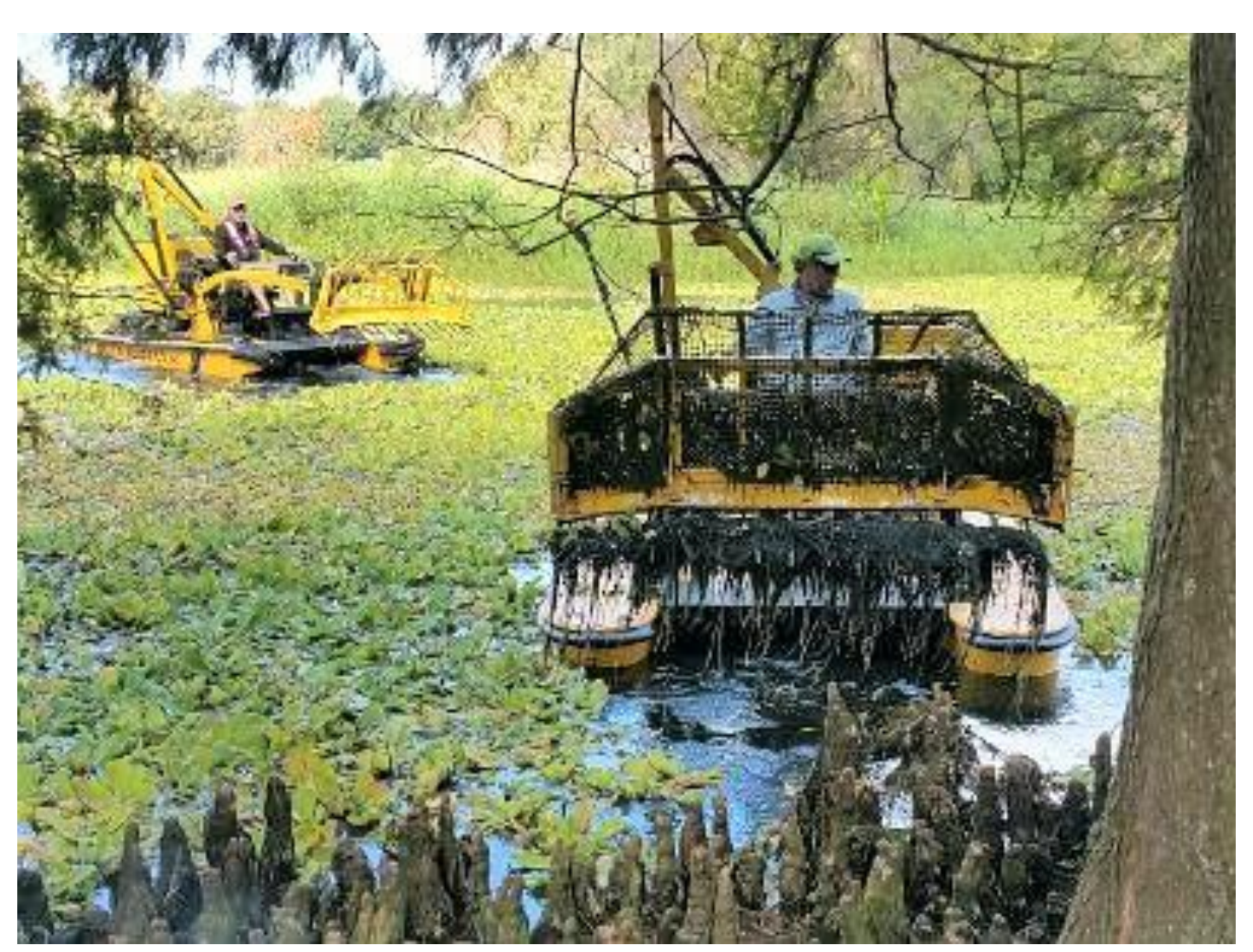
2 WEEDOOs removing rotting vegetation.

Thanks to Jungle Terrace's daily persistence and help of State Legislator: City permanently installed 14 aerators, hired two Lake Management companies to return Jungle Lake to its pristine health, and perform MONTHLY MAINTENANCE!