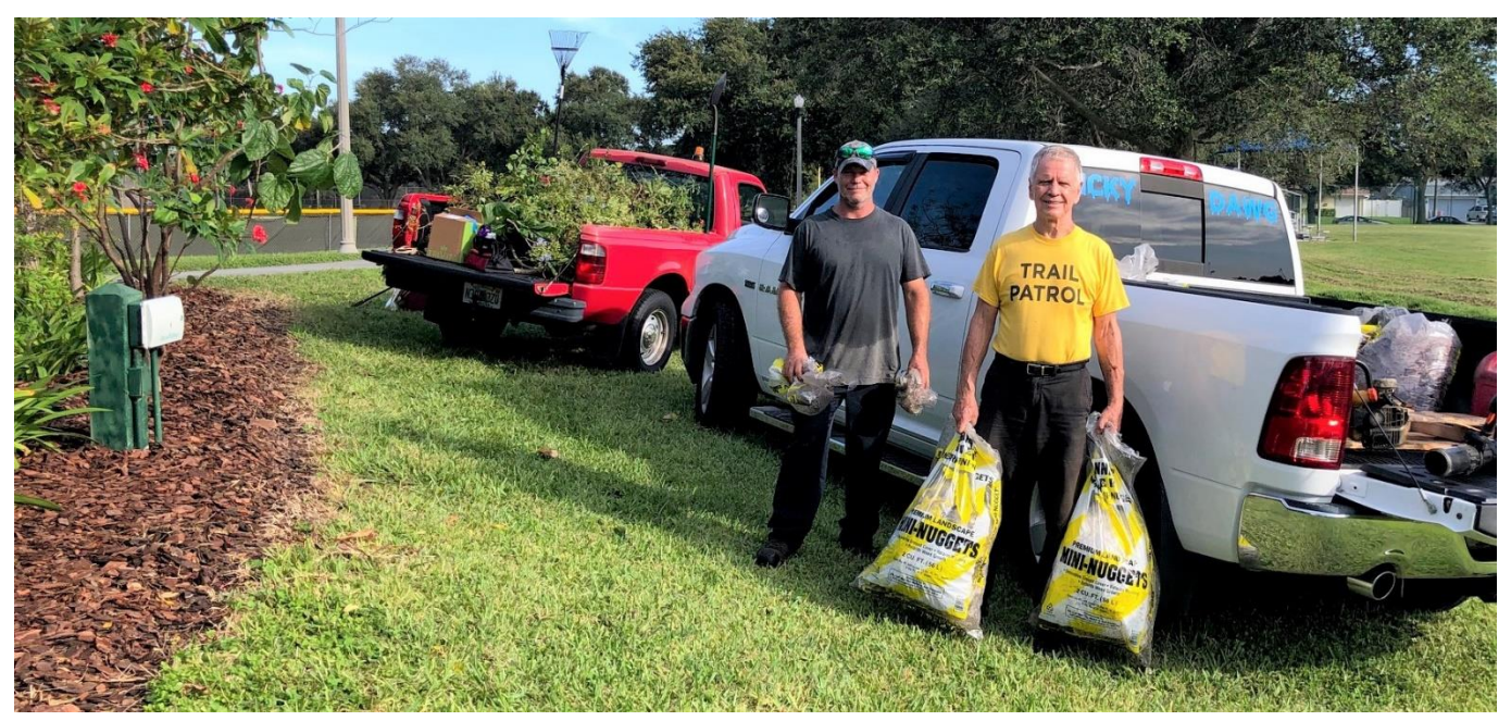
Trucks, Trimmings, Equipment, Bags for Recycle