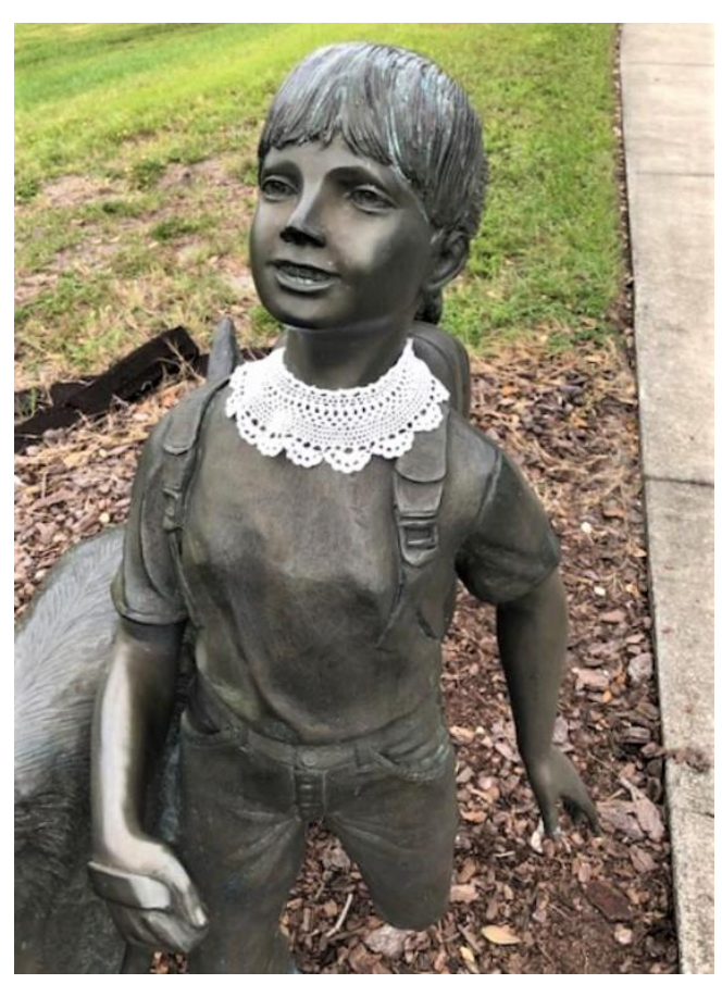
JT Statue in Park, Tatting Lace collar added.

Appreciating the County's help on the Trail land behind Greek Church, 4 Volunteers invested 18 hour of their lives expanding mower footprint and removing two very large bags of vagrant clothing, jeans, bra, underwear, purse, cans, bottles, etc. and etc.