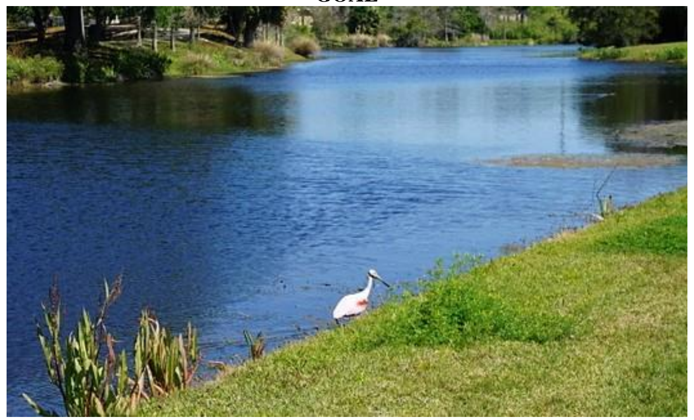
Our Jungle Lake used to look like this: well maintained and beautiful. GOAL for current intense effort to clean up and restore health and fish.