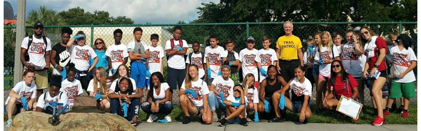
"Pick up something!"