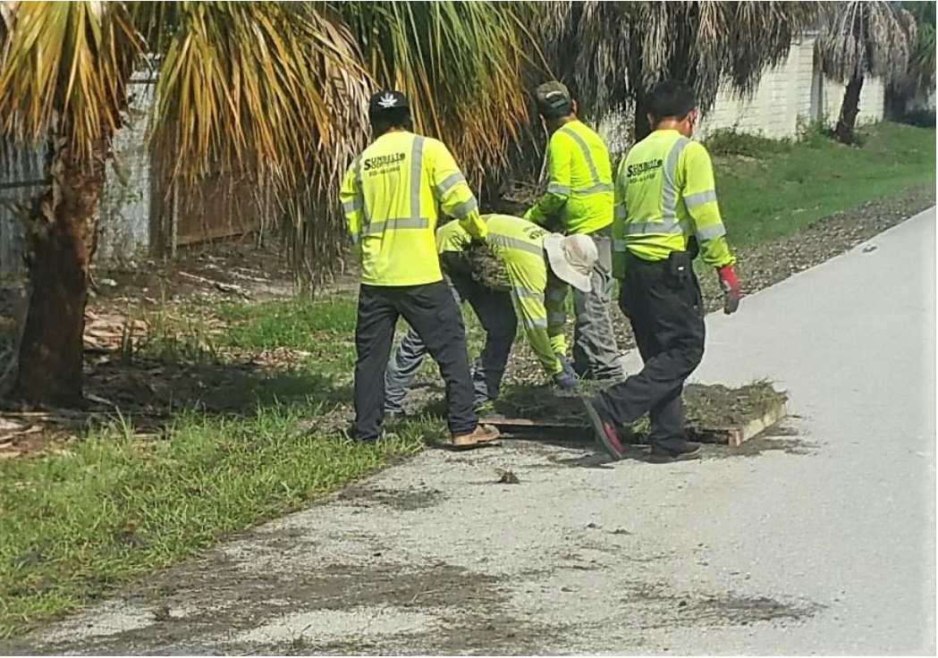
Fill dirt to bring up to Trail level, then Sod!