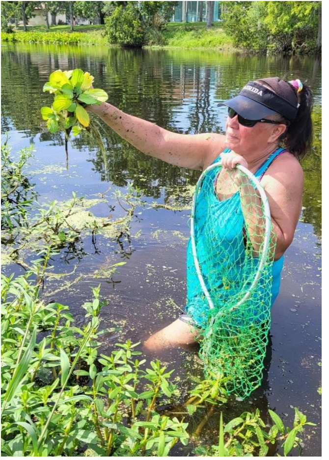
A Family of Water Lettuce.