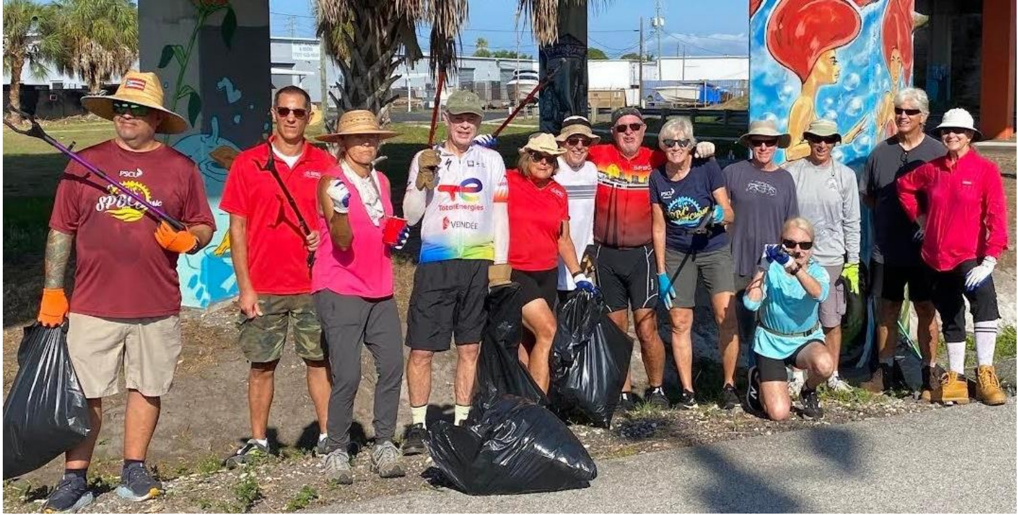
12 Large Bags of Litter!