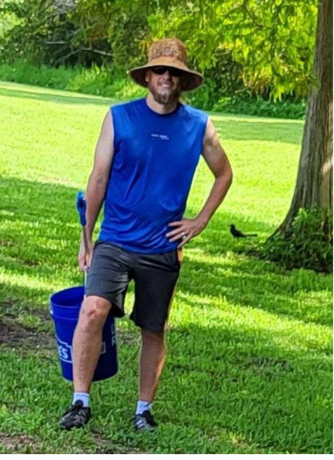
Ah! Shade after a successful endeavor.

VOLUNTEER ~ 3 month project. <u>Acegang1@aol.com</u>