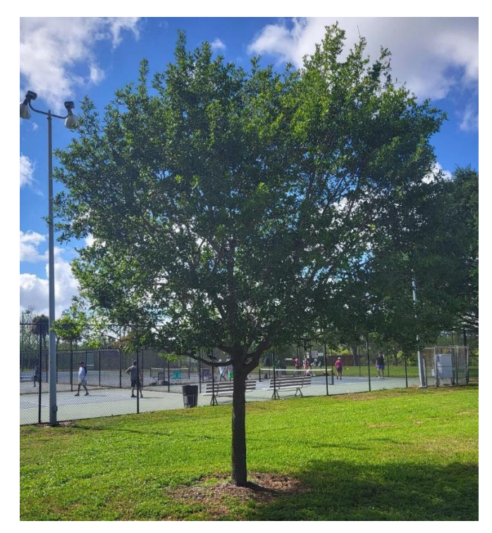
DOG PARK OAKS (Replacing ancient Magnolias)