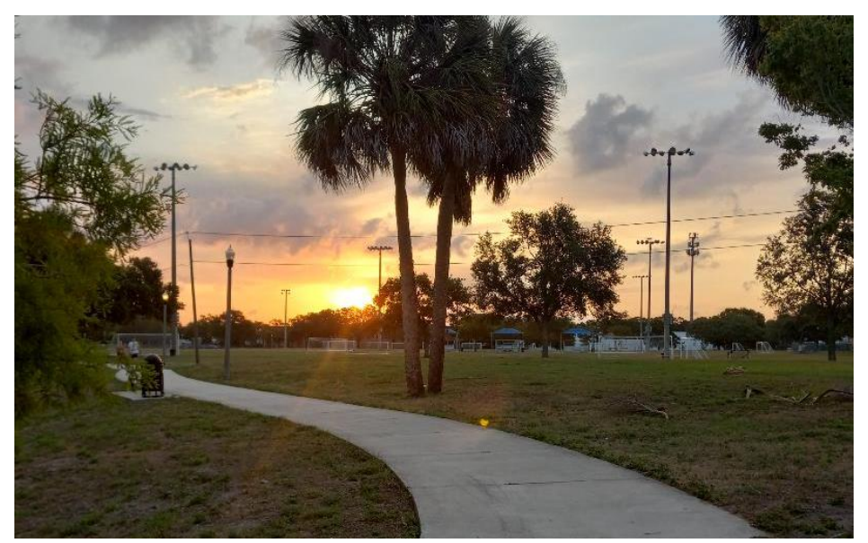
Walter Fuller Sunrise

Facebook Event Link: https://www.facebook.com/events/220725564235777