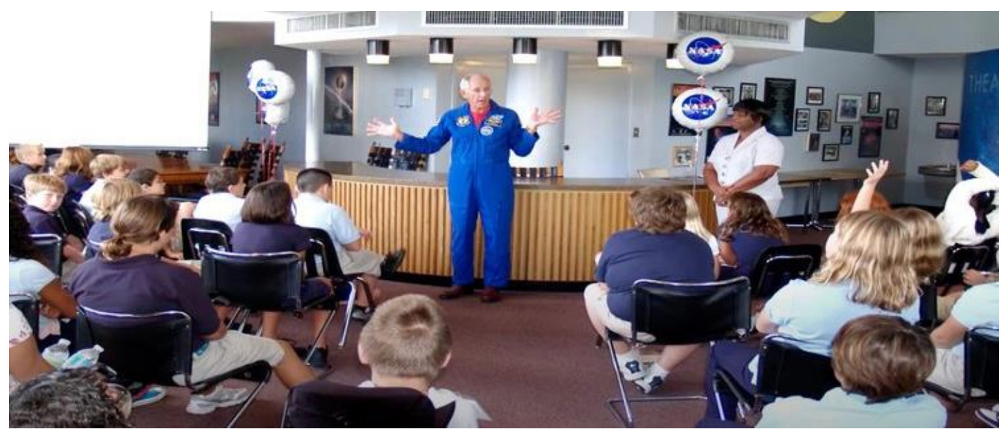
WHEN OPEN, THE SCIENCE CENTER OFTEN PARTNERED WITH NASA TO INSPIRE AND ENCOURAGE STUDENTS TO PURSUE CAREERS IN SCIENCE, TECHNOLOGY, ENGINEERING AND MATH (STEM)

Additionally, the outside space includes room for outdoor adventure courses, agricultural education, and alternative farming. There is also potential for outdoor event rentals.