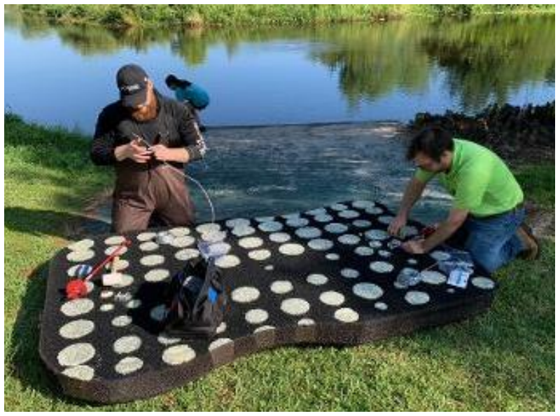
Planting the Floating Wetland Island.