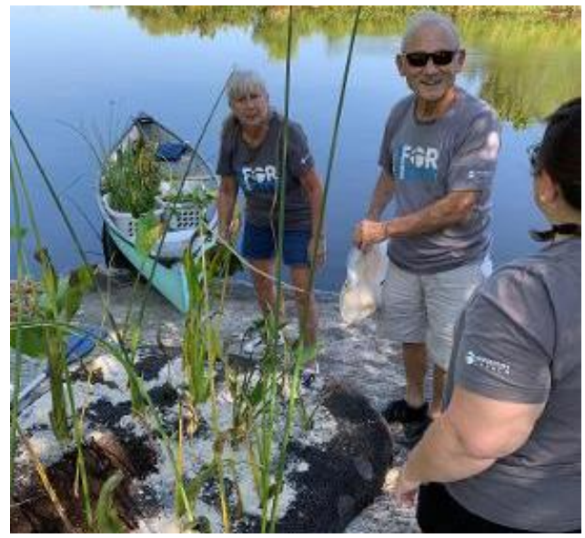
Volunteers loading plants in canoe.