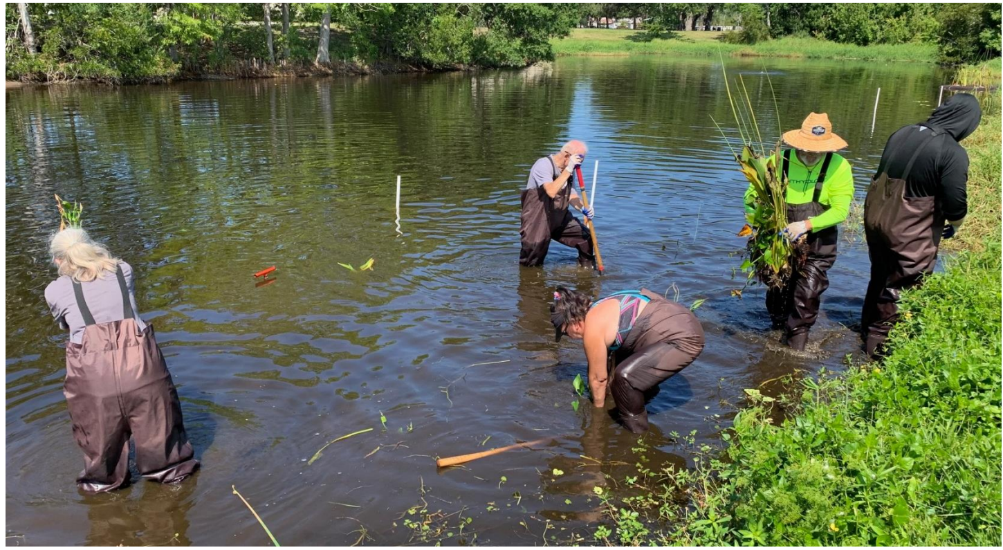
Planting Jungle Lake – ReVegetation for plants to clean up the water.