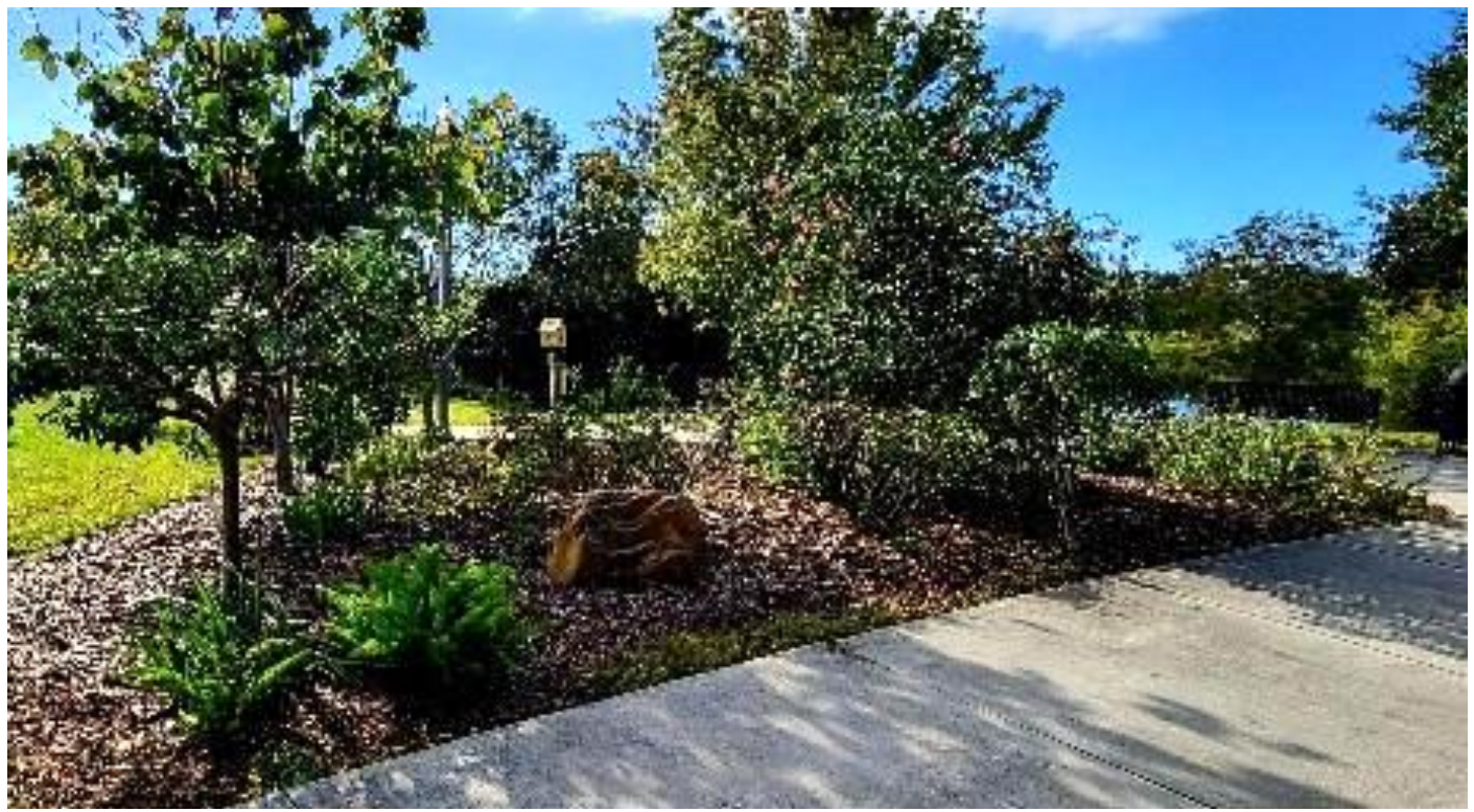
Plant 4 Rose Bushes + Gardenia Bush