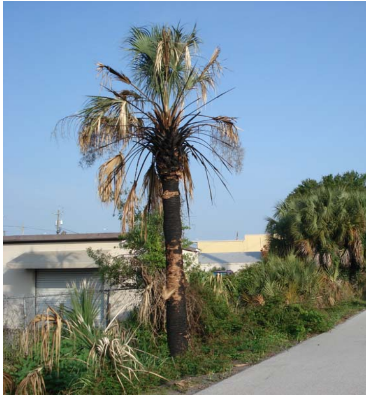
Two more fore locations along the trail. These look older.