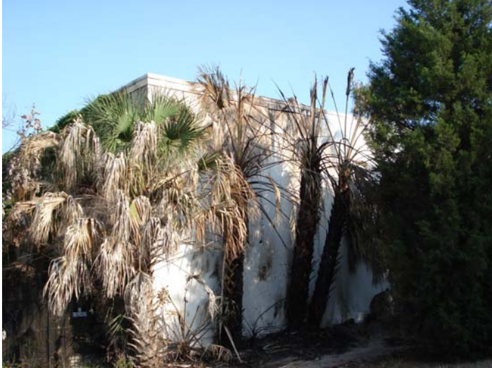
(above) This is a recent fire that scorched the back wall of a building. (below) this fire is next to the Mall parking lot. Both fires were around Memorial Day.

that fires had occurred. Two locations were burned within a week of Memorial Day. Seeing these I started to notice other fire locations. Some looked old but there are 6 - 8 locations between 22nd Ave. and 38th Ave. I took some pictures and added them below. I went to Fire Station #9 located at the corner of 5th Ave and 66th St and asked if they were aware of the fires. They were aware and said the fires were likely set but they didn't know who was doing it. I told them I would let our neighborhood association know. Maybe there is someone that can add some information to the mystery.